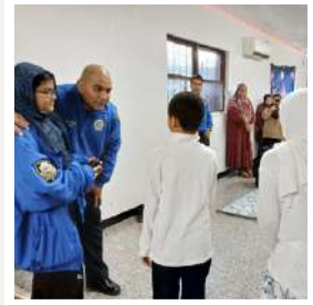
NYPD Community Affairs Visit