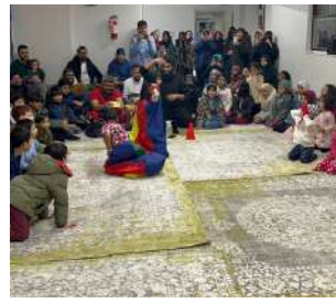
MCC Family Night