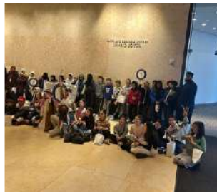
Interfaith Harmony Visit