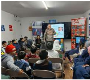
Student SDG Projects